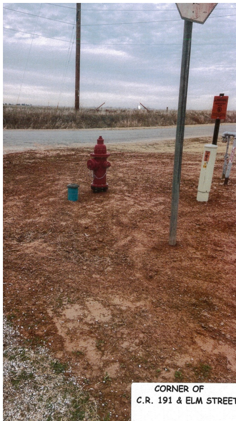
CORNER OF C.R. 191 & ELM STREET