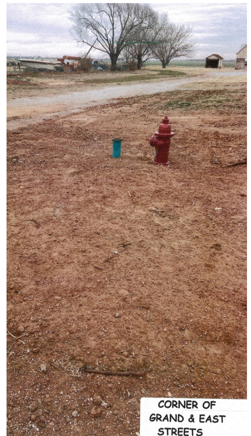
CORNER OF GRAND & EAST STREETS