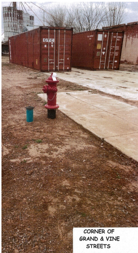
CORNER OF GRAND & VINE STREETS

Like many rural communities throughout Oklahoma, Davidson officials struggle to keep their infrastructure in good repair. The old fire hydrants no longer worked, and something had to be done to provide better protection to its citizens. Davidson town officials decided to apply for a 2019 REAP grant to fund new hydrants throughout town as well as the addition of two strategically placed shutoff valves to ensure the whole town would not be without water when needed repairs were made. The pictures below show some of the new hydrants that were installed with REAP funding. Congratulations to the citizens of Davidson! Please remember to thank your rural legislators who continue to ensure REAP funding continues. REAP funding truly is the lifeline for some communities' existence.