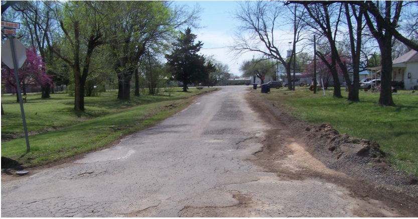
Before (above) and After (below) on CLEMENS STREET