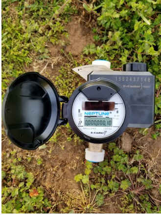
New - Automatic

An audit of their water meters revealed that half of them have measured over 1M gallons and are between 10-20 years old. The Oklahoma Department of Environmental Quality suggested the water meters needed to be replaced since they over a decade old. The old meters progressively read less accurately with time resulting in meter readings below what was actually used.