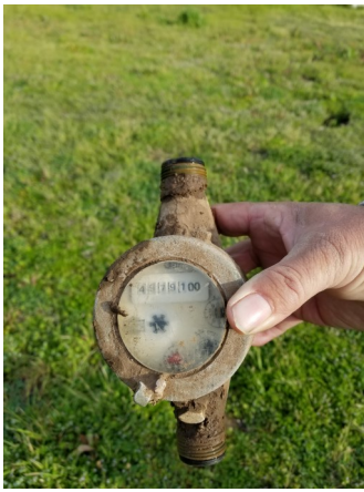
Old - Hard to Read

The Town of Ryan is a small rural community of less than 900 residents in Jefferson County. The Town is the sole provider and source of water, sewer,, and electrical services for its residents. They currently have 336 water customers.