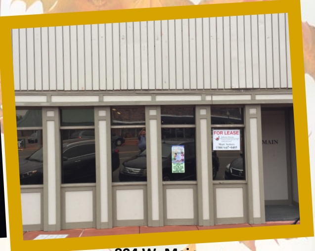
804 W. Main